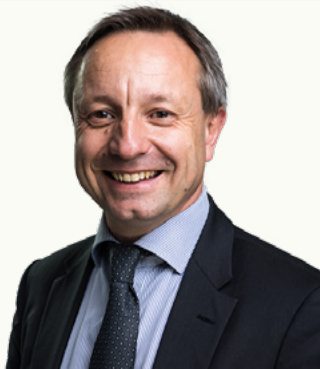
Jonathan Brearley, CEO, Ofgem February 2020

This action plan is just the start of Ofgem's drive to play our role in achieving net zero by 2050.